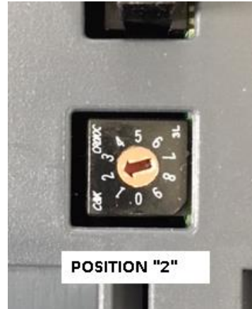
Amplifier Module Position Setting Switch